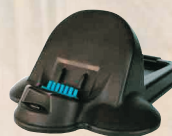
Desktop Cradle (Choice of USB or Serial)